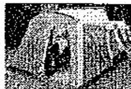
KB3A Operates CW during a recent RAE Field Day operation.

Date and Time Period: Field Day is always the fourth full weekend of June, beginning at 1800 UTC Saturday and ending at 2100 UTC Sunday. Field Day 2002 will be held June 22-23, 2002.