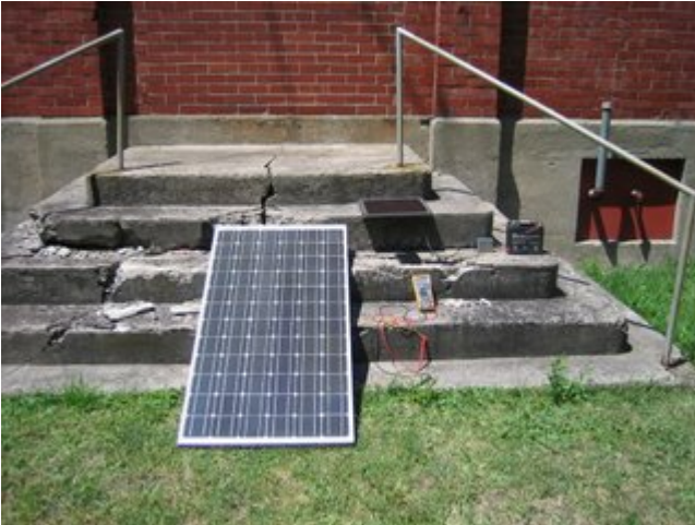
Rick WA3MKT brought out a solar panel for the "Alternative Power Source" this year