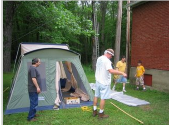
Getting the Tents up