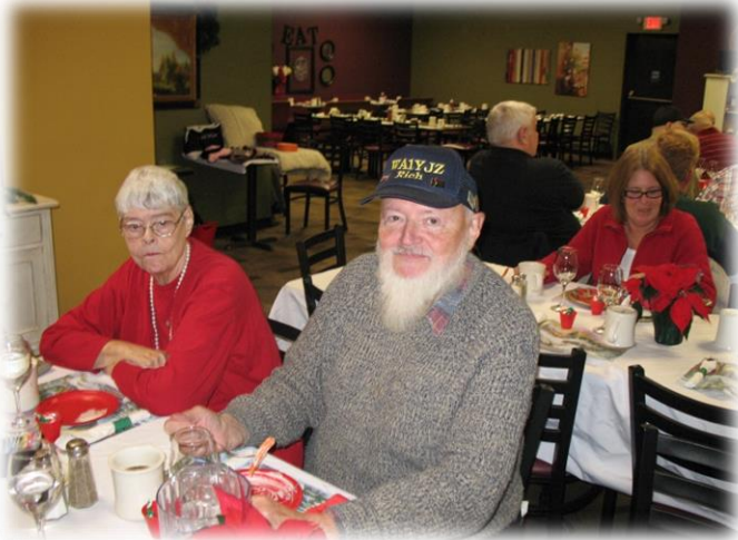
The Christmas Party

was held at the Skyline Restaurant and a good time was had by all, in spite of snow storm that struck at the same time as the party.